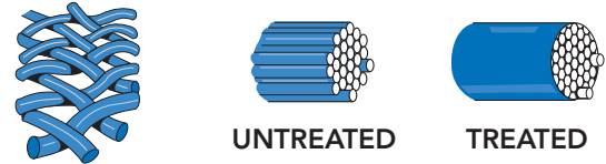
MAGNIFIED VIEW OF FABRIC

Platinum Shield's Rip, Tear, Burn guarantees you against perforation due to accidental rips, tears or burns. It will cover 100% of the cost to repair cuts, tears, and burns less than 5 cm in length on your leather, cloth or vinyl upholstery with no deductible on your end.